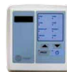
New Digital Wired Display