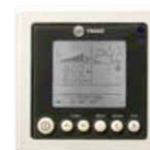
Digital Room Thermostat