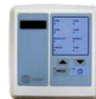
New Digital Wired Display