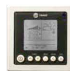
Digital Room Thermostat